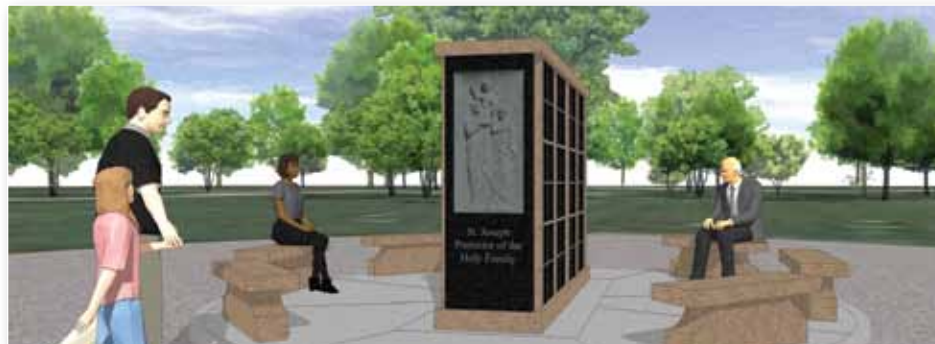
To accommodate needs in Shawnee, a new columbarium is being developed for St. Joseph Cemetery, 61st and Quivira Road.

With space in the current columbarium completely committed, Catholic Cemeteries will add a new monument for cremated remains at St. Joseph Cemetery, 61st and Quivira Road, Shawnee, Kan. Construction is underway for the St. Joseph, Protector of the Holy Family, Columbarium. The new columbarium will be located in the northeast section of the cemetery and will offer 96 niches with additional niches available in benches surrounding the monument. Projected completion date for the St. Joseph Columbarium is by spring 2012.