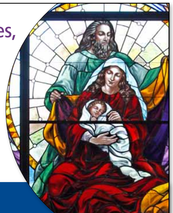
Photo of stained glass in Holy Family Mausoleum, Resurrection Cemetery, Lenexa, Kan.

We pray blessings on you and your loved ones and extend wishes for a joy-filled Christmas and a Happy New Year.