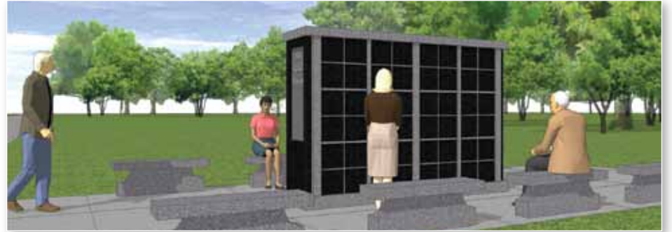
The artist's rendering depicts the new Holy Family Columbarium, Mt. Calvary Cemetery, Topeka.

In response to the increasing popularity of cremation as a burial option, Catholic Cemeteries of Northeast Kansas has announced plans to add new columbaria at cemeteries in Shawnee and Topeka.