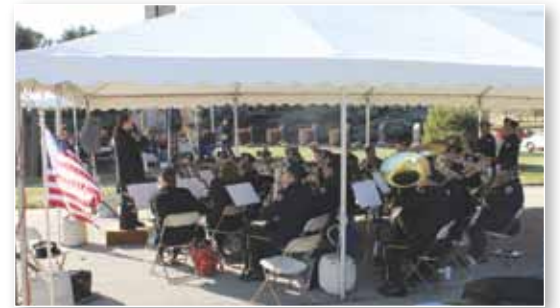
The American Legion Band provided a patriotic prelude and music during the program.