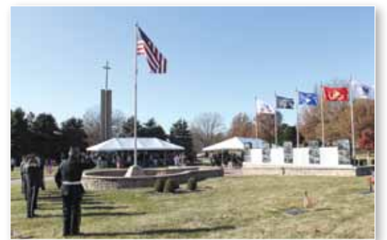
Veterans of Foreign Wars Post 7397 formed the color guard at the ceremony.